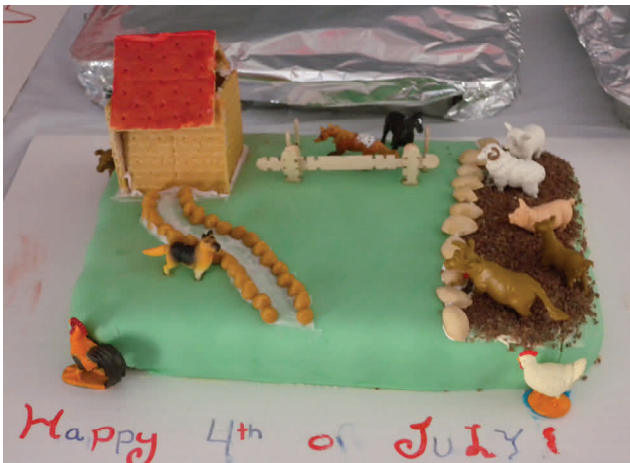
Keeping it Rural - Farm scene on cake