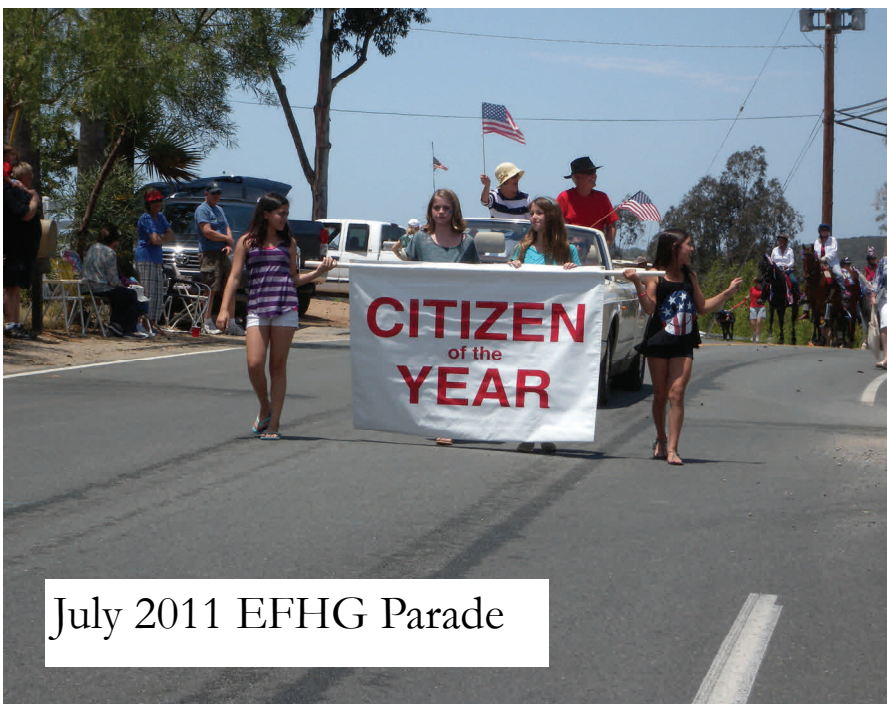
July 2011 EFHG Parade

Finally, OMWD has awarded the pipeline contract to Utah Pacific and construction of the raw water pipeline down Elfin Forest Rd will begin this fall.